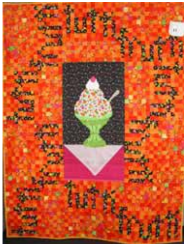
1st Place Connie Little