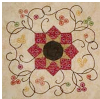
Bottom: Cindy Blackberg's "Mountain Blossoms"