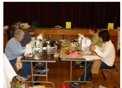
Students busy at work at the workshop.