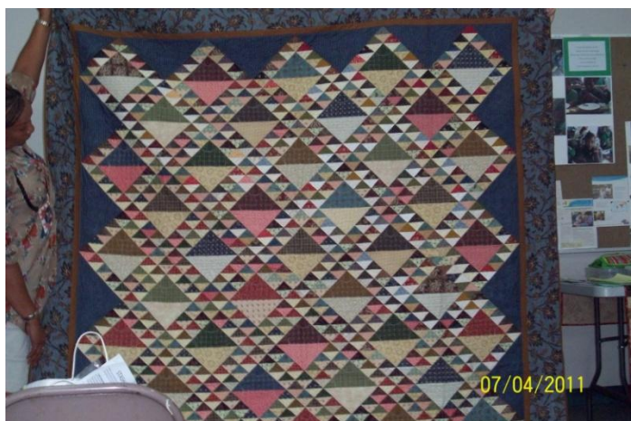
Scrap quilt from the program