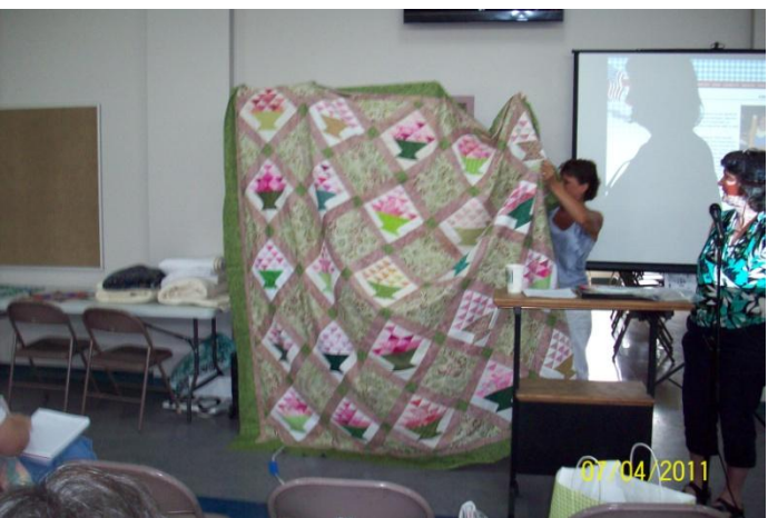
TN Breast Cancer Coalition Quilt