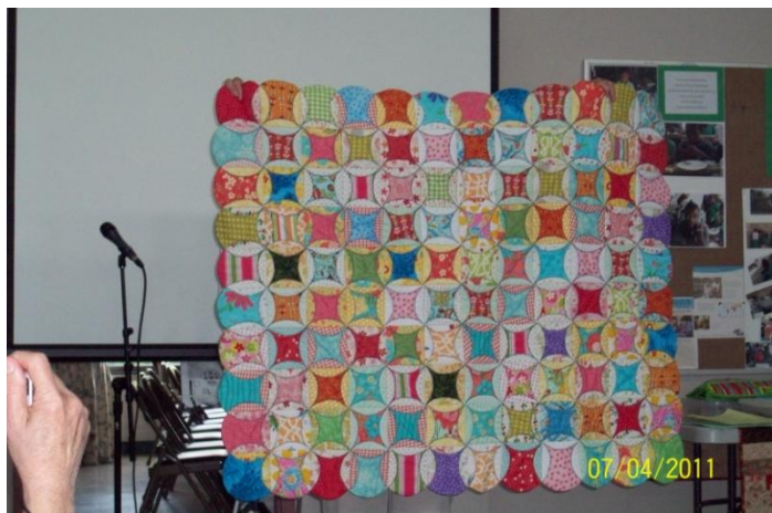
Scrap quilt from the program