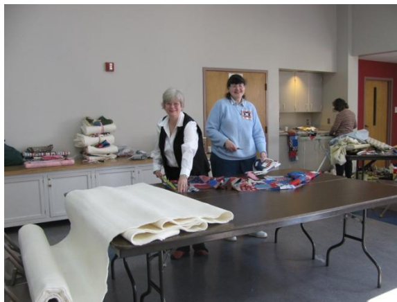
March Soldier Quilt Workshop Pictures